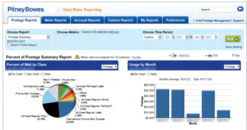
Total Meter Reporting